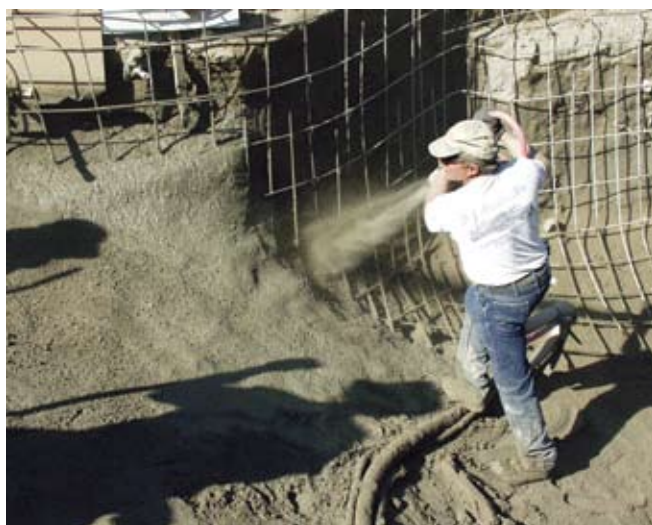
Shoot the cove and the floor at the base of the wall before the wall is shot to eliminate rebound, overspray, and trimmings from becoming trapped at this critical location