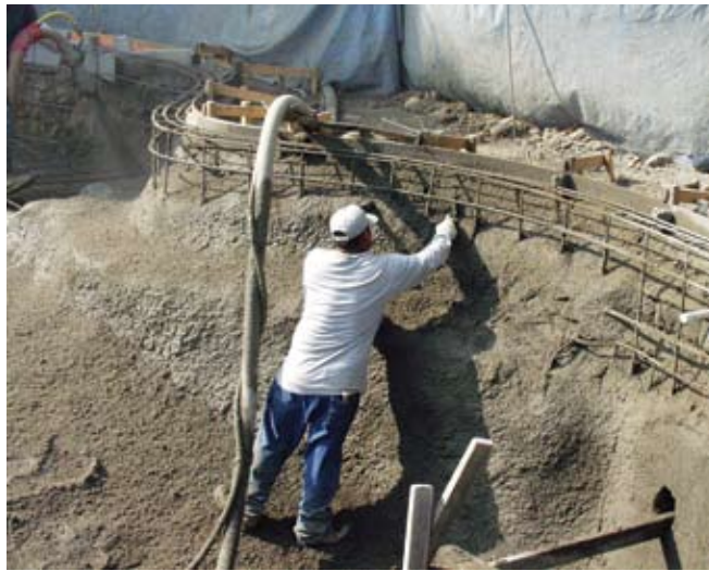
Joints standing for over 30 minutes must be cut to a 45-degree angle then cleaned and wetted before placing additional shotcrete