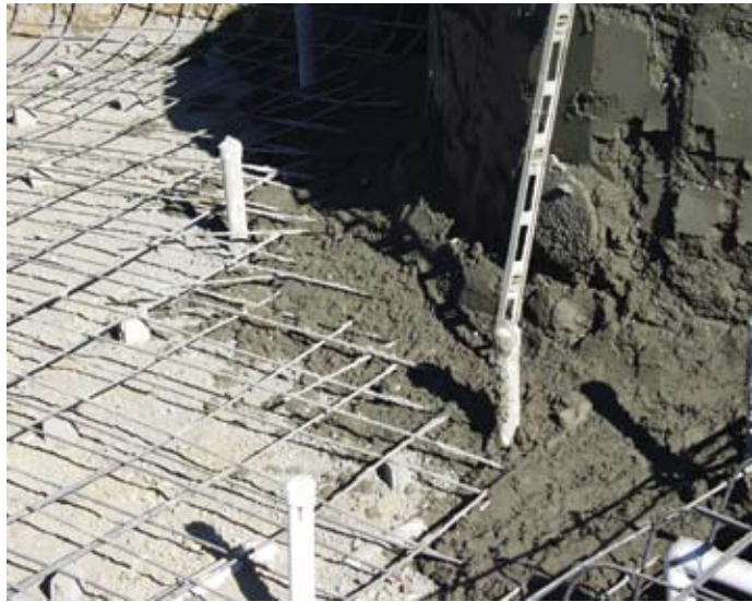
The typical practice is to cut the walls and allow the trimmings to fall to the unshot floor at the base of the wall

A fact that I repeatedly stress in the seminars I give to the pool industry on the shotcrete process is that shotcrete is not a special product; it is simply a method of placing concrete. Therefore, many of the recommended practices for concrete placement by other methods apply. Trimmed material dislodged from its shot location should be treated as conventional concrete. Based on this,