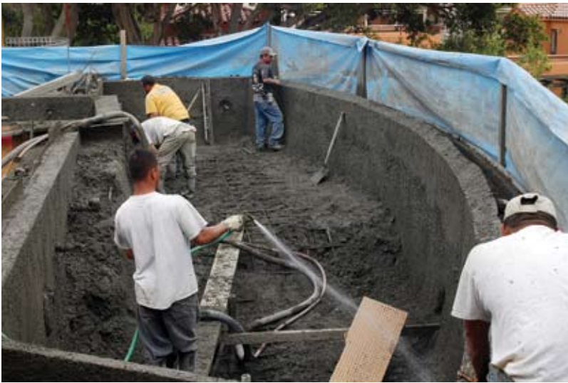
It's common to hose down the piles of trimmings with water and drag the "over wetted" and re-tempered trimmed material to envelop the floor reinforcement