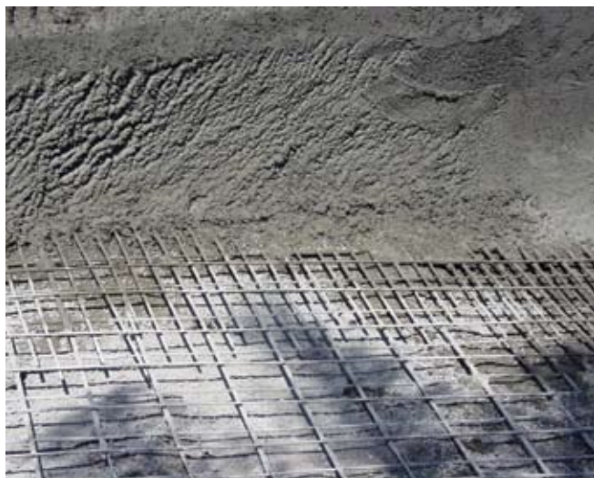
Here's a typical joint that stood for over 30 minutes—notice the overspray and rebound. No cleaning and wetting took place before placing new material