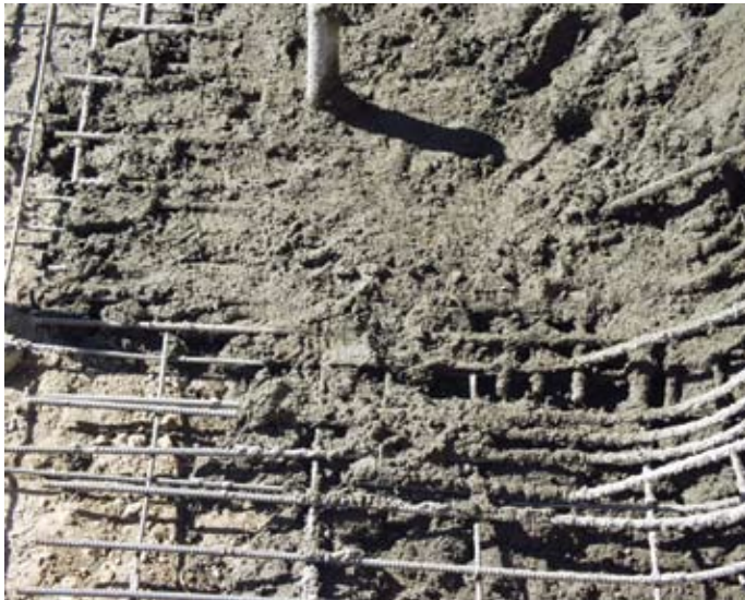
This trimmed material sat in a pile at the base of the wall for over 90 minutes. Remember, concrete consolidation and reinforcement encapsulation are critical elements of structural concrete placement

I'll offer eight reasons why the reuse of trimmings in swimming pool construction should not be encouraged.