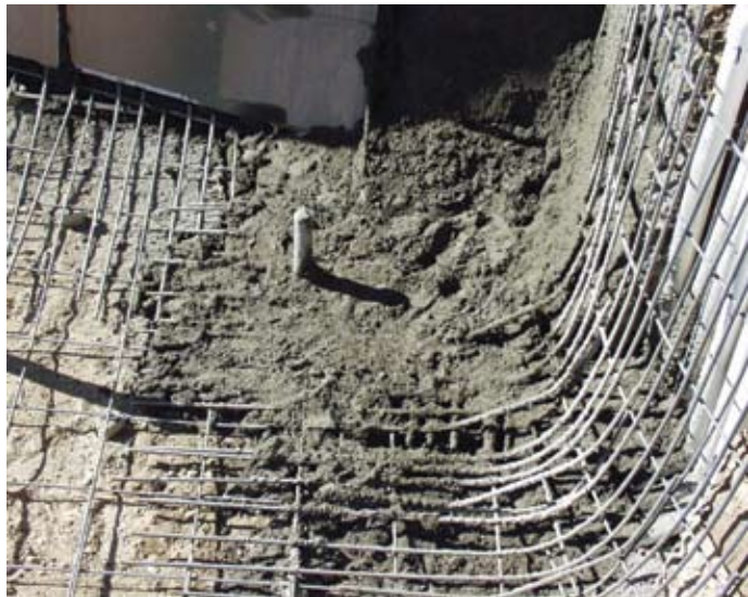
Trimmed shotcrete is no longer consolidated after falling from its shot location and landing on the pool floor