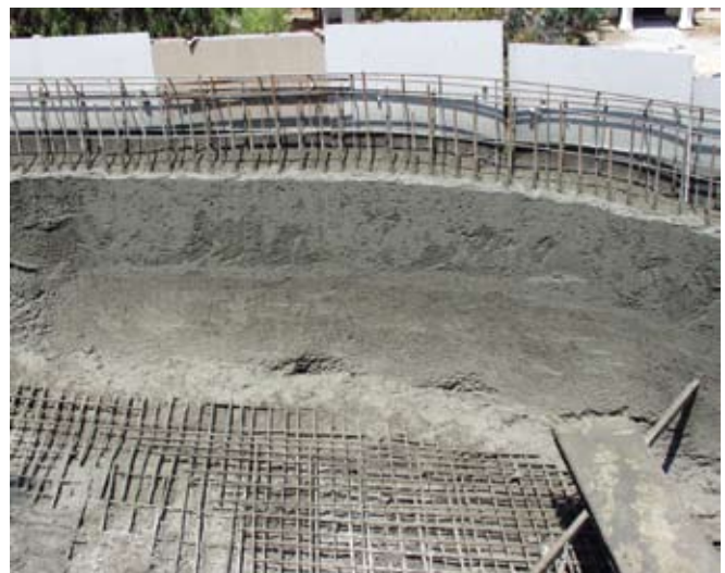
Here's the same wall (as in the first photo) after trimming. No joint preparation or removal of overspray or rebound was done