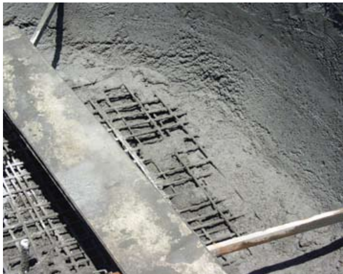
The trimmed concrete typically lands at the base of the wall on top of rebound and overspray